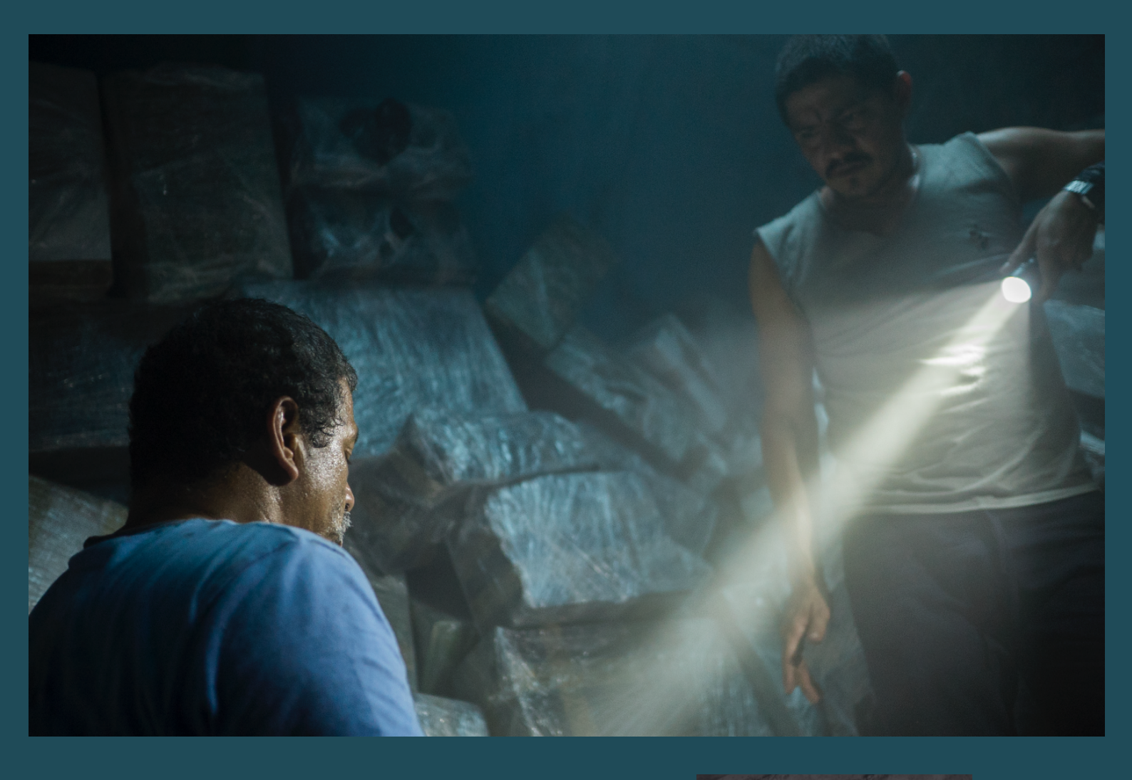
MAIN CREW Production Designer Emilia Dávila http://www.imdb.com/name/nm3682582/